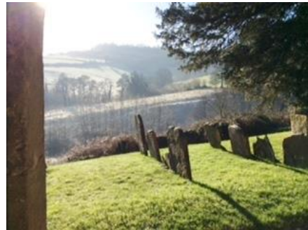
Spring sunshine & frost from the church porch