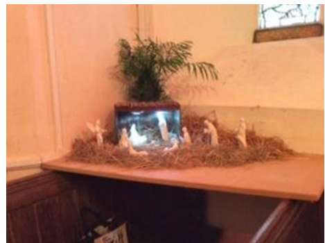
The Christmas crib