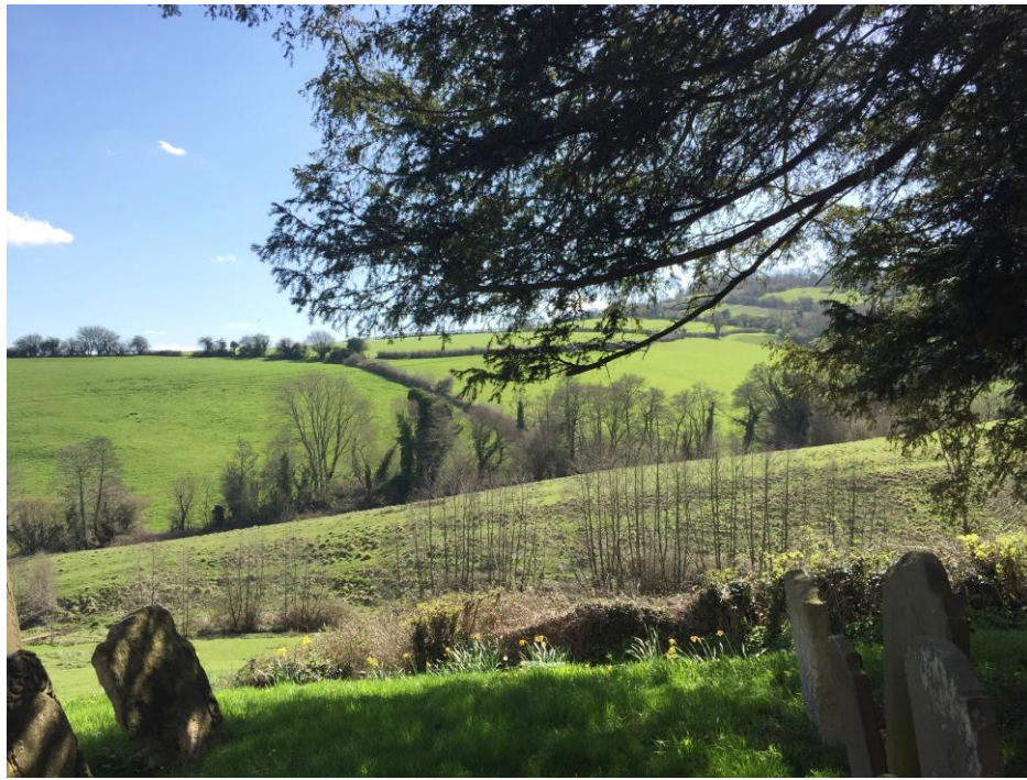
View south from the churchyard