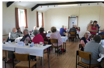
Second Saturday in the Village Hall

SECOND SATURDAY returned this autumn and we are delighted that so many regulars have returned. We look forward to seeing you and your friends in the New Year.